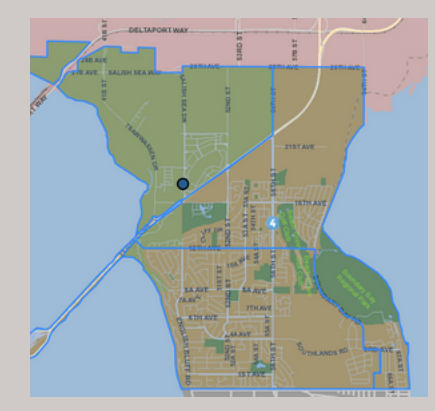
Ladner (District 2)